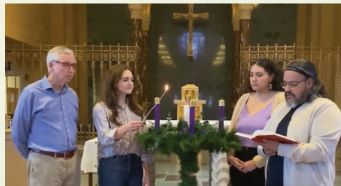
2023 MFM Assembly at Candle Lighting Prayer for Advent Wreath (See prayer on facing page).