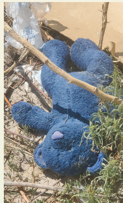
A toy abandoned in the U.S.-Mexico border at El Paso, Texas-Ciudad Juarez, Chihuahua

Jesus said to his disciples: "As it was in the days of Noah, so it will be at the coming of the Son of Man. In those days before the flood, they were eating and drinking, marrying and giving in marriage, up to the day that Noah entered the ark. They did not know until the flood came and carried them all away. So will it be also at the coming of the Son of Man. Two men will be out in the field; one will be taken, and one will be left. Two women will be grinding at the mill; one will be taken, and one will be left. Therefore, stay awake! For you do not know on which day your Lord will come. Be sure of this: if the master of the house had known the hour of night when the thief was coming, he would have stayed awake and not let his house be broken into. So too, you also must be prepared, for at an hour you do not expect, the Son of Man will come."