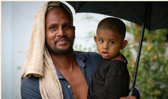
A father and son in Nopara, a village near Srinagar, Bangladesh.

This is how the birth of Jesus Christ came about. When his mother Mary was betrothed to Joseph, but before they lived together, she was found to be with child through the Holy Spirit. Joseph, her husband, since he was a righteous man yet unwilling to expose her to shame, decided to divorce her quietly. Such was his intention when, behold, the angel of the Lord appeared to him in a dream and said, “Joseph, son of David, do not be afraid to take Mary your wife into your home. For it is through the Holy Spirit that this child has been conceived in her. She will bear a son, and you are to name him Jesus, because he will save his people from their sins.” All this took place to fulfill what the Lord had said through the prophet: Behold, the virgin shall