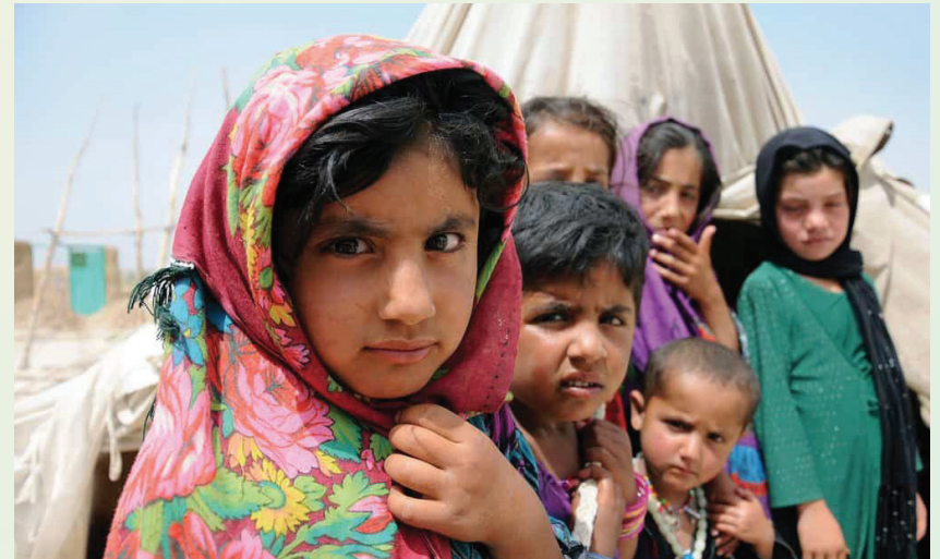
Afghan children find temporary shelter at a camp for internally displaced persons in their war-ravaged homeland.

As they were going off, Jesus began to speak to the crowds about John: "What did you go out to the desert to see? A reed swayed by the wind? Then what did you go out to see? Someone dressed in fine clothing? Those who wear fine clothing are in royal palaces. Then why did you go out? To see a prophet? Yes, I tell you, and more than a prophet. This is the one about whom it is written: Behold, I am sending my messenger ahead of you; he will prepare your way before you. Amen, I say to you, among those born of women there has been none greater than John the Baptist; yet the least in the kingdom of heaven is greater than he."