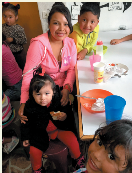
2018 Guatemala Immersion

Dear Jesus, as we prepare to celebrate your birth this Christmas Day, may we remember that you were born as a migrant with your mother giving birth to you in a stable among the animals because there was no place else for you. As we remember the challenging situation of your birth, may we reach out especially to the migrant, refugee, and homeless families in our area who also face difficult circumstances. Amen