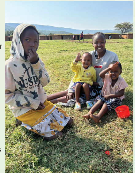
2024 Kenya Immersion Trip

As we prepare for your birth dear Jesus, open our hearts so that we can be people of justice like your cousin John the Baptist, speaking out about what is wrong, unfair, and sinful. Give us the courage to create a better world where all people feel welcome, especially those who are fleeing violence, hunger, or environmental disasters in their own countries. Amen