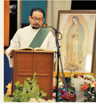
Religious Education Congress, Yoque/Los Angeles

For a version of this story designed for Grades K-2, visit https://maryknoll.link/K2