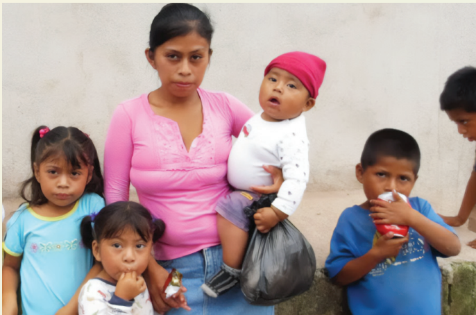
2013 Guatemala Immersion Trip

You invite us during Advent to open our hearts and our lives more deeply to you. As people hurry to and fro shopping these days, remind us to slow down to connect with you in prayer. Remind us to see your face especially in the faces of the families who are migrants and refugees. Let us welcome them as if we were welcoming your Holy Family into our town. Amen