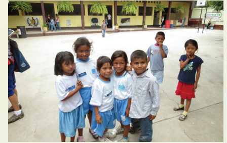
2013 Guatemala Immersion Trip