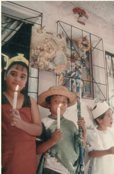
El Salvador, Posada 1999