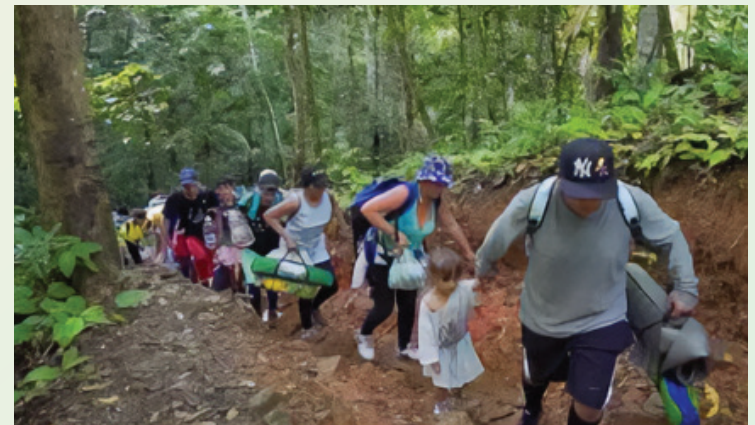
A Venezuelan migrant family climbing a steep hill in the Darién Gap.

As Joseph sought an inn or home for Mary to give birth to Jesus, he was repeatedly turned away with responses of "There is no room, no room." In these days of Advent let us especially reach out to migrants and refugees who also are often greeted with responses of "No room or we don't want you." May we welcome in your name those who have no place else to go. Amen