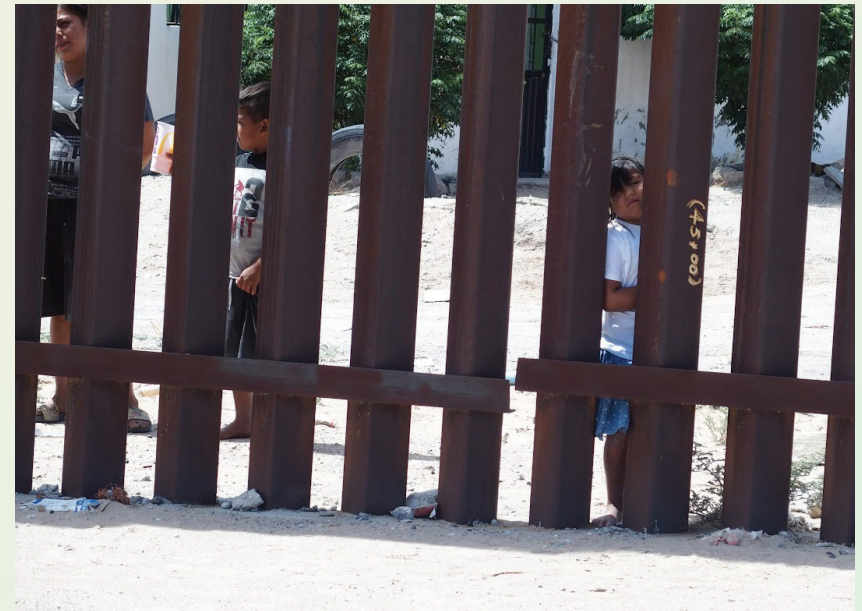
MFM El Paso-Juarez Immersion Trip 2019

Put the figures of Joseph and Mary in your creche or manger scene, but not the baby Jesus (You can put him in on Christmas morning). You can also add the Wise Men or Three Kings.