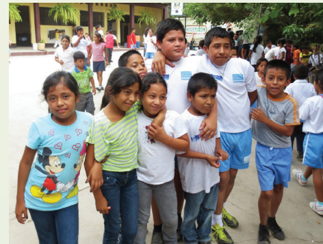
2013 Guatemala Immersion Trip

Sometimes, God wants us to pray for others that we may not know. As a family, pray for a family forced to migrate. You do not need to know their names, where they are from, or where they are. Just know that they need your prayers. If you have the tradition of lighting an Advent wreath, pray for the family when you light your candles, or pray at meals or at bedtime.