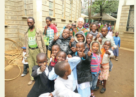
MFM / Africa