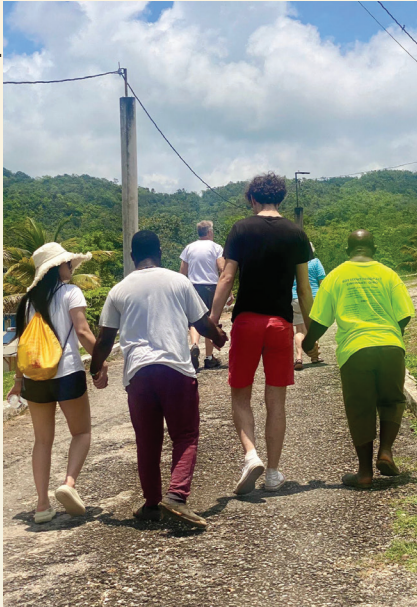
2024 Jamaica Immersion Trip

presume to say to yourselves, 'We have Abraham as our father.' For I tell you, God can raise up children to Abraham from these stones. Even now the ax lies at the root of the trees. Therefore every tree that does not bear good fruit will be cut down and thrown into the fire. I am baptizing you with water, for repentance, but the one who is coming after me is mightier than I. I am not worthy to carry his sandals. He will baptize you with the Holy Spirit and fire. His winnowing fan is in his hand. He will clear his threshing floor and gather his wheat into his barn, but the chaff he will burn with unquenchable fire."